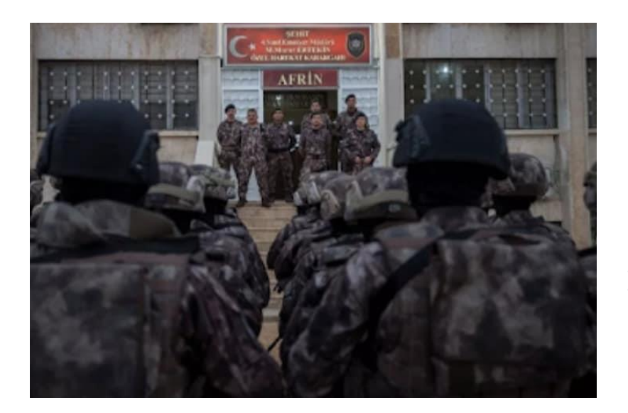
Figure 1. Photo of the entrance of a school in Afrin, which was used as a recruitment center by the Turkishbacked Syrian National Army to recruit Syrian mercenaries, prior to sending them to Azerbaijan to fight against the Armenians of Artsakh.

More specifically, on September 23, 2020, the Hawar news agency leaked the names and pictures of 42 Syrian mercenaries who were recruited in Afrin and deployed to Azerbaijan to fight against the Armenians of Artsakh.<sup>12</sup>