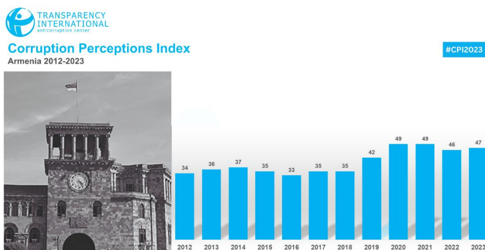
Figure 1 shows Armenia's CPI scores from 2012 to 2023.

For data used for the calculation of Armenia's 2023 CPI see Corruption Perception Index 2023: Full Source Description on the above-mentioned "2023 Corruption Perception Index (CPI)". It should be noted that for the calculation of Armenia's 2023 CPI score the same sources were used, as in 2021 and 2022. Those sources are the Bertelsmann Stiftung Transformation Index 2024 ( BTI ), Corruption sub-indicator of the Freedom House Nations in Transit 2023 report ( FH ), Global Insight Country Risk Ratings 2022 ( GI ), Political Risks Services ( PRS ) International Country Risk 2023 Guide ( PRS ), Varieties of Democracy 2023 edition (VDEM) and World Economic Forum Executive Opinion Survey 2023 ( WEF ). 1